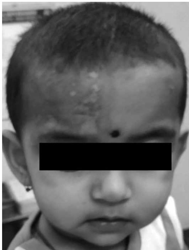
Figure 3. Complete resolution after 1 week of treatment.

On ophthalmic consultation, tobramycin eye drop twice and lubricating eye drop four times a day were started. Visual acuity was difficult to assess. Left eye was normal. There was no past history of varicella in the infant and neither was she vaccinated for varicella. Her mother had developed varicella infection during 7th month