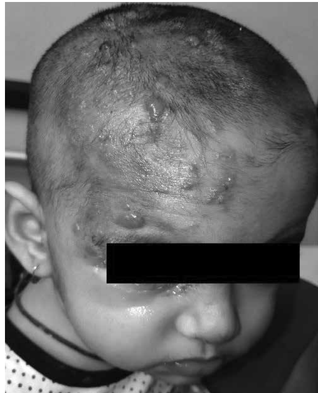
Figure 1. Vesicular eruption over right side of forehead, nose and tip of nose with marked erythema and swelling of right upper eyelid.

nasal bridge and tip of nose (Fig. 1), suggesting involvement of nasociliary branch of the ophthalmic division of right trigeminal nerve, thus positive Hutchinson's sign. There was marked erythema and swelling of the right upper eyelid with difficulty in opening of right eye.