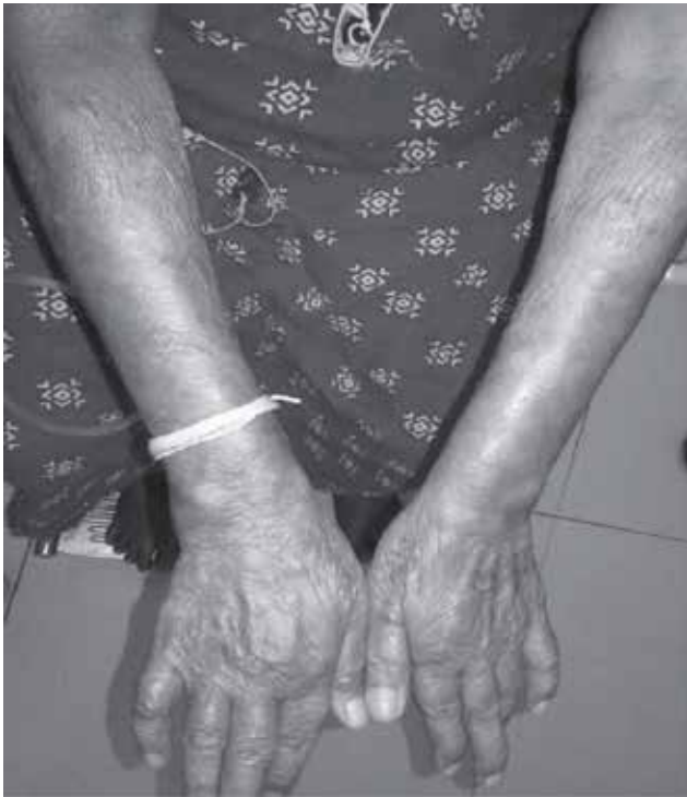
Figure 1. Multiple red-colored raised lesions (ENL) over body.

adjacent to the angle of mouth (Fig. 2). Xerosis and ichthyosis characteristic of leprosy was visible over bilateral upper limbs (Fig. 3). There was no history of photosensitivity or any drug intake or application of any local irritant prior to the initial lesion.