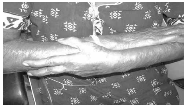
Figure 3. Xerosis and ichthyosis visible over bilateral upper limbs.

imaging was normal. She responded well and her flexor spasms decreased. A psychiatric consultation was sought for her depression due to chronic illness and was started on antidepressants.