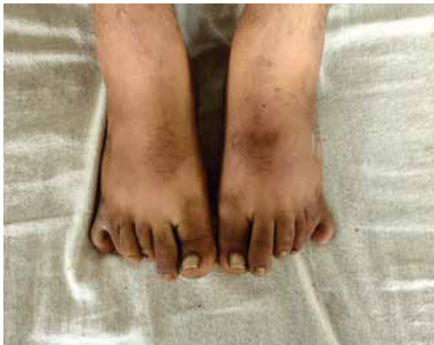
Figure 1. Showing hexadactyly in both lower limbs.