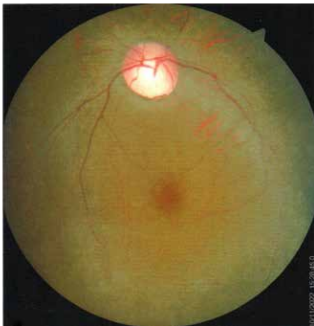
Figure 2. Fundus showing arterial attenuation, pale waxy disc with bony spicules in mid periphery.

hemoglobin levels, normal total leukocyte count, with mild thrombocytopenia ( 10,000/\text{mm}^3 ). Liver function tests showed normal bilirubin with mildly increased serum aminotransferase levels (SGOT 94 U/L and SGPT 80 U/L). Renal function tests were within normal limits. Urinalysis revealed proteinuria and glycosuria. Chest X-ray and ECG were normal. His fever profile revealed Plasmodium falciparum malaria. Ultrasonography showed mild hepatosplenomegaly with bilateral renal parenchymal Grade 1 disease with decreased testicular volume.