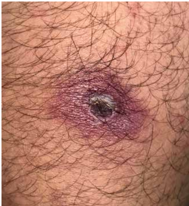
Figure 1. Eschar, consisting of a central tough black scab surrounded by dull red areola. It is neither pruritic nor painful.

A 54-year-old male was admitted to the hospital on 24th July, 2023 with an 8-day history of fever with chills. He had an ulcer with surrounding erythema on the left thigh (Fig. 1), and vaguely recalled being bitten by an insect in the same area a week before the ulcer developed. This incident occurred during an outdoor party at a friend's farmhouse in a suburban area. The patient developed an erythematous maculopapular rash on the day of admission (Fig. 2). He had a 20-year