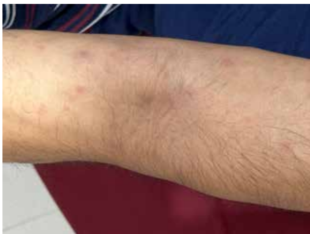
Figure 2. Maculopapular rash usually appearing first on the trunk and spreading (centripetal) to limbs between 5th to 8th day illness

history of diabetes treated with a combination of insulin aspart and insulin aspart protamine and had taken an antibiotic (amoxicillin clavulanate) initially but discontinued it due to gastrointestinal side effects. He had taken cefuroxime for 3 days before admission. The patient was febrile with a temperature of 103°F (Fig. 3), normal blood pressure and a pulse rate of 101/min. Physical examination revealed clear lungs, tachycardia, mild abdominal distension with no tenderness and restlessness. Laboratory investigations are detailed in Table 1.